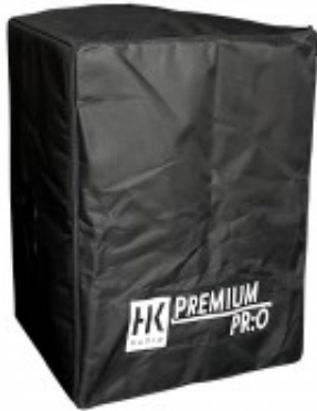
Protective Covers for all Cabinets